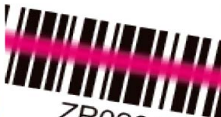
Step 2: Run