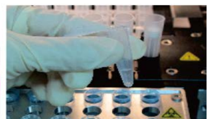
Step 3: Obtain