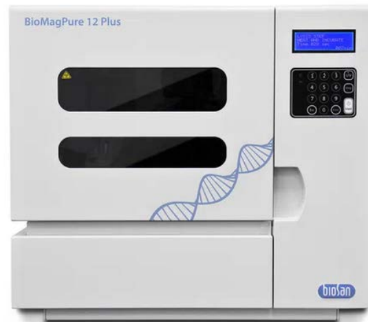
Extractor BioMagPure 12 Plus

With the flexibility of processing 1-12 samples per run, the BioMagPure 12 is tailor-made to fit small clinics and early stage laboratories. By occupying minimal counter space and greatly reducing technician man-hours, this series allows organizations to operate facilities in a much more cost effective fashion.