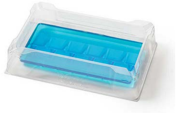
50 ml reagent reservoir, polypropylene (PET)