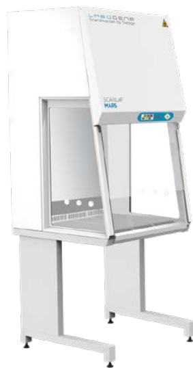
Mars Pro 900 (650 x 900 x 700 mm)