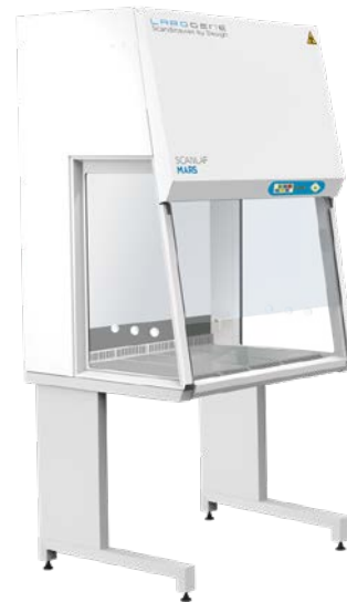
Mars Pro 1200 (650 x 1200 x 700 mm)