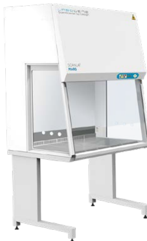
Mars Pro 1500 (650 x 1500 x 700 mm)