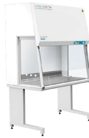
Mars Pro 1800 (650 x 1800 x 700 mm)