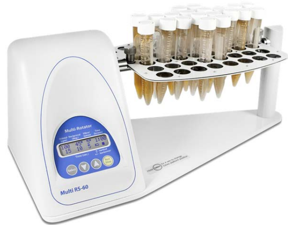
Multi RS-60 rotator with platform PRS-48

Low voltage external power supply (24 V) provides electrical safety in humid environment.