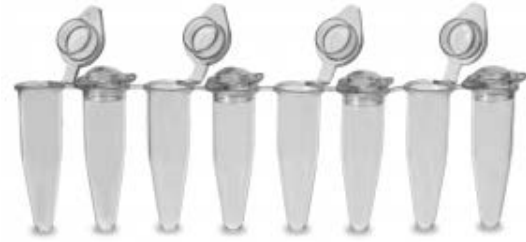
0.2 ml strip-tubes with domed lid, attached