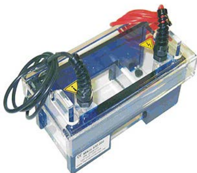
Electrophoresis chamber Micro top view